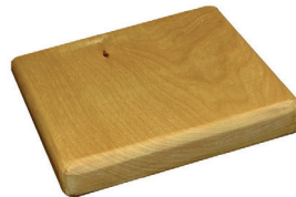
Wood block according EN 14988