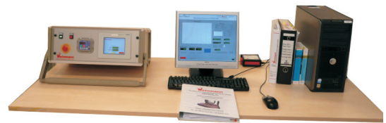
PLC control box with PC customer parts for processing.